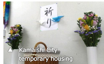
▲ Kamaishi City temporary housing

We are now coming upon 2 years since the occurrence of the Great Eastern Japan Earthquake. On March 11th, at each of our bases in Kamaishi, Sendai, Shinchi and Onahama, we stood side by side with those who we have met, and remembered in prayer those who fell victim to the disaster, and those who still are in distress even now. At Sts Peter and Paul Church, Koriyama, some 80 people came together, and prayed in the 2nd Year Memorial Communion and Victim Memorial Service for the Great East Japan Earthquake.