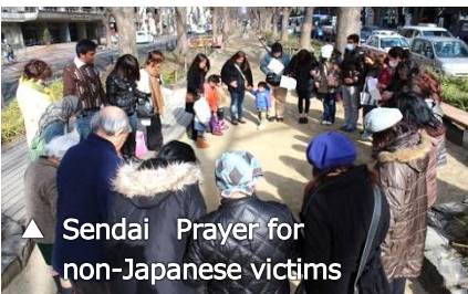
▲ Sendai Prayer for non-Japanese victims