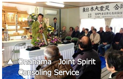
▲ Onahama Joint Spirit Consoling Service