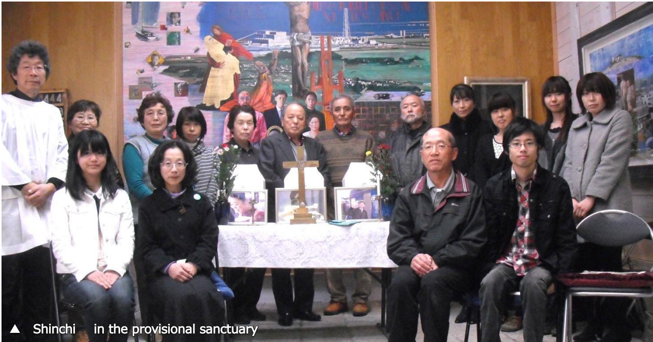
▲ Shinchi in the provisional sanctuary